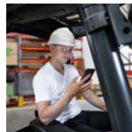
When parts arrive, Agilon® updates the number of those parts and acknowledges receipt of the order.