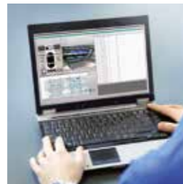
Remote monitoring ensures that your service functions correctly.