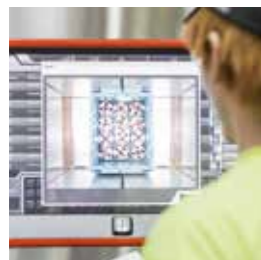
Agilon® monitors the volume of components in your warehouse and reacts when the number reaches pre-defined thresholds.