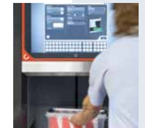
If necessary, retrieve packages from Agilon® to check the item balance.