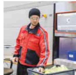
Finished products transfer inside Agilon® directly to dispatch. Time to completion – from assembly to order delivery – will become shorter.

Agilon® makes inventory simple – you will save time and money