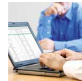
The system stores the transaction and allows full monitoring of inventory levels.