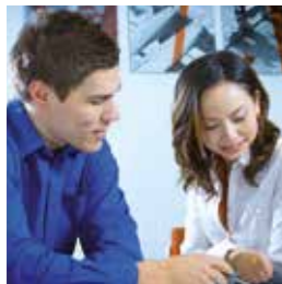
We can help you to design production and warehouse layouts using a wide range of options possible with Agilon®.