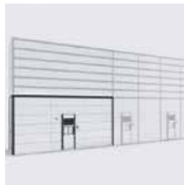
The Agilon® system can be expanded when your operations change.