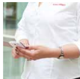
The Agilon® system automatically sends email reminders to the purchaser or additional orders directly to suppliers.