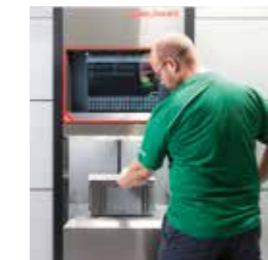
Users collect items from the Agilon® access point. They can simultaneously check the number of remaining items and confirm they did a check.

Agilon® makes inventory simple – you will save time and money