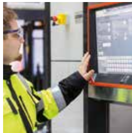
Incoming items are received directly by Agilon® and data transferred to the enterprise resource planning system.